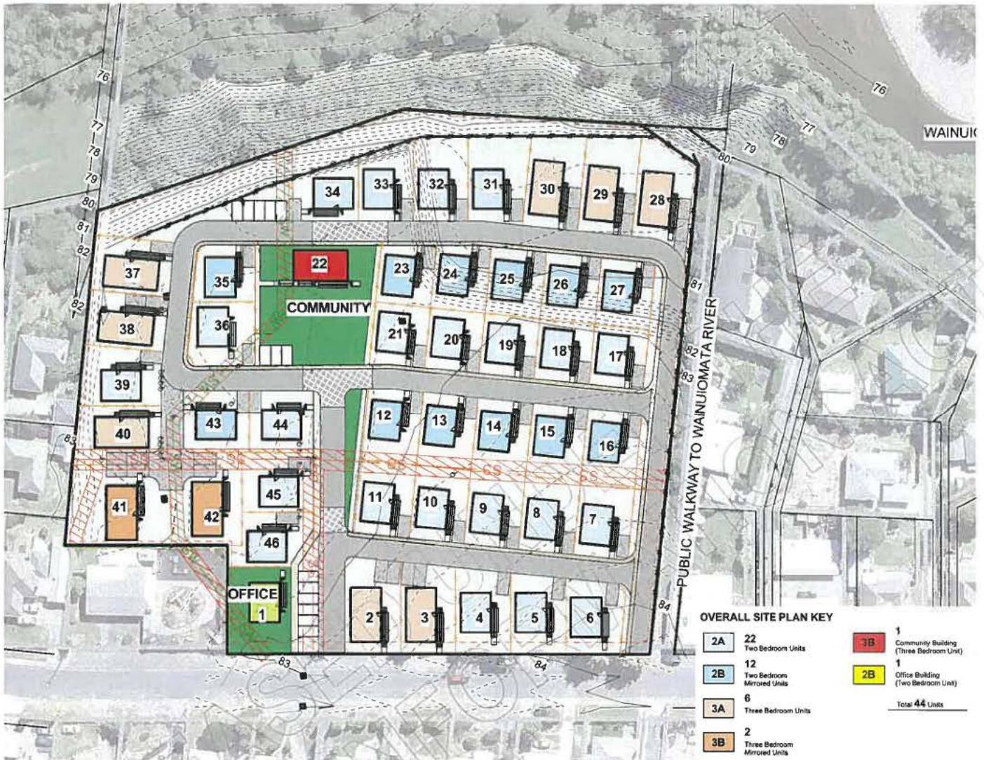
DRAFT plans for Wood Street development. The mix of housing size (eg. two or three bedroom homes) may change as work progresses.